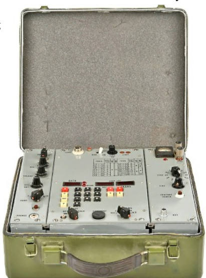
R-394 T in a provisional transit case.

Being primary used in Western counties, inscription of the controls were usually in English, not only to deceive its origin, but also for easier operation of the usually local recruited agents whose knowledge of the Russian language was limited.